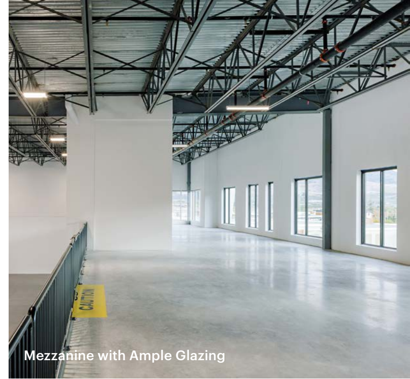
Mezzanine with Ample Glazing

As an owner at Stratosphere, Beedie will be there to support you every step of the way, creating a seamless experience to meet your property needs, leaving you free to focus on your business.