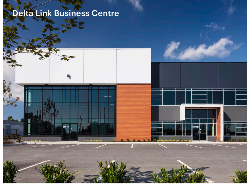
Delta Link Business Centre

Whether you are an owner or tenant at Stratosphere, Beedie will be there to support you every step of the way, creating a seamless experience to meet your property needs, leaving you free to focus on your business.