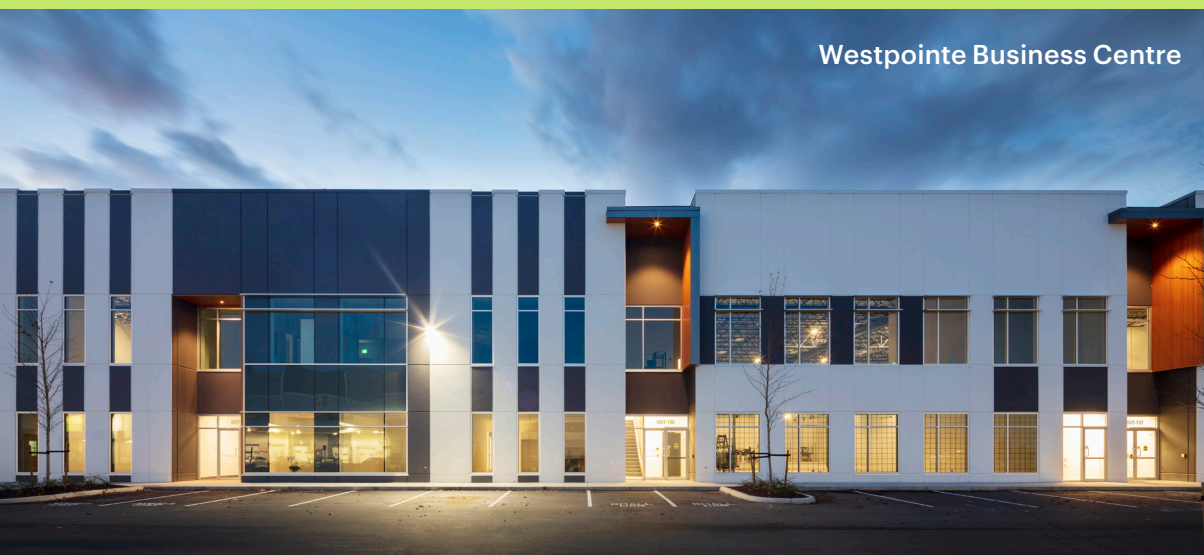
Westpointe Business Centre

A team of experts to help you navigate through the approvals for office improvements and corporate signage installation