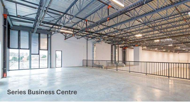
Series Business Centre