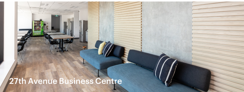
27th Avenue Business Centre