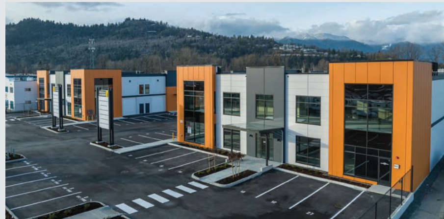
64,572 sf over two buildings Wesmont Yale Centre