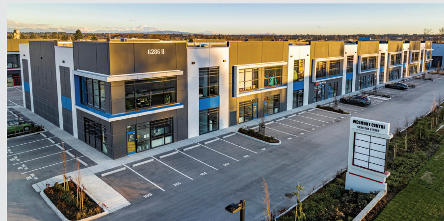
119,887 sf over three buildings Wesmont Centre