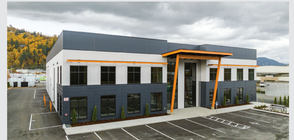
21,386 sf industrial building 8085 Aitken Road