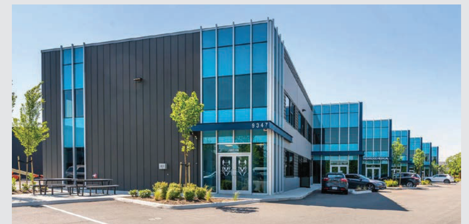
82,472 sf over two buildings Port Kells Centre