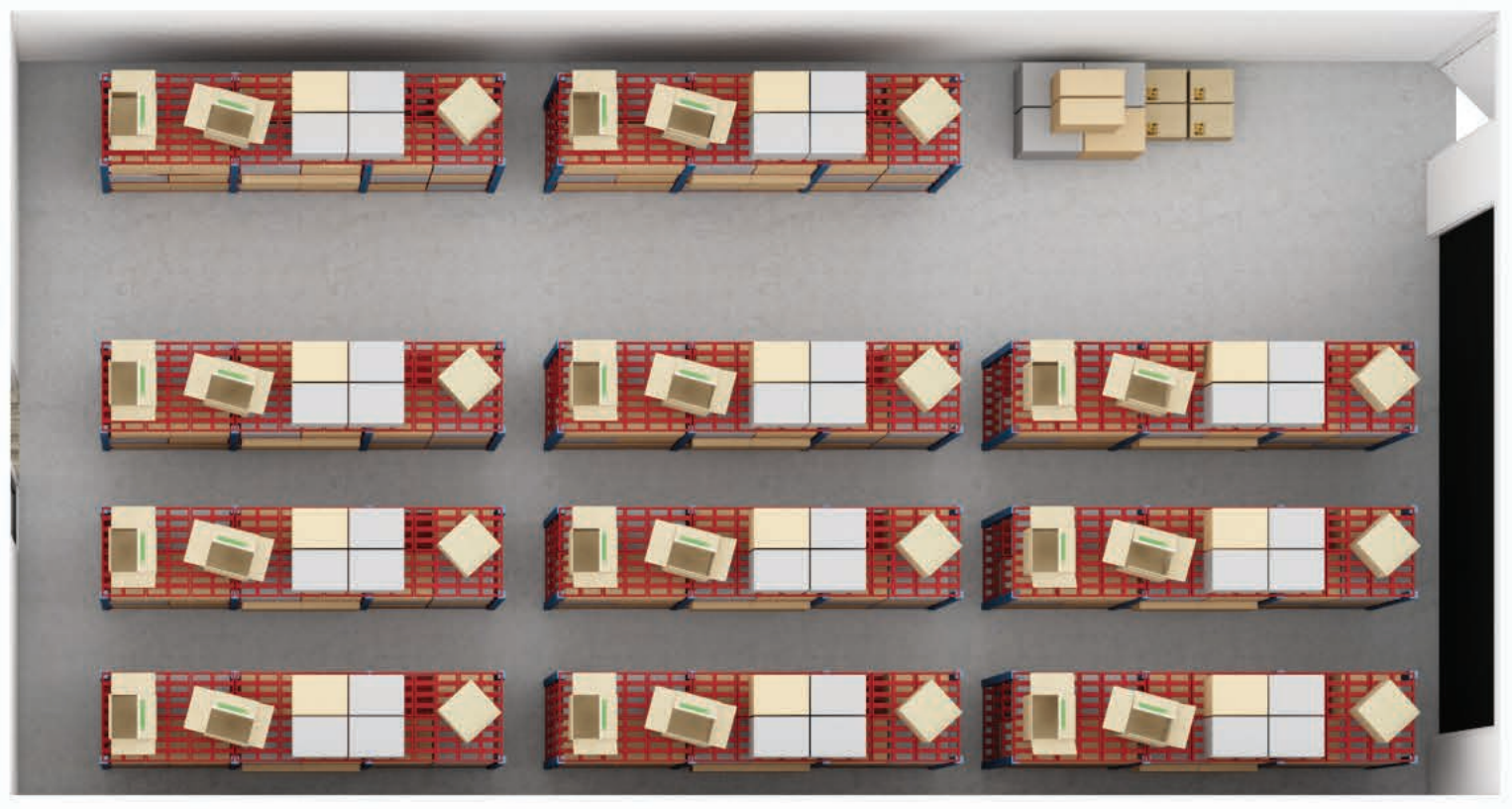
Ground Floor - Office & Warehouse